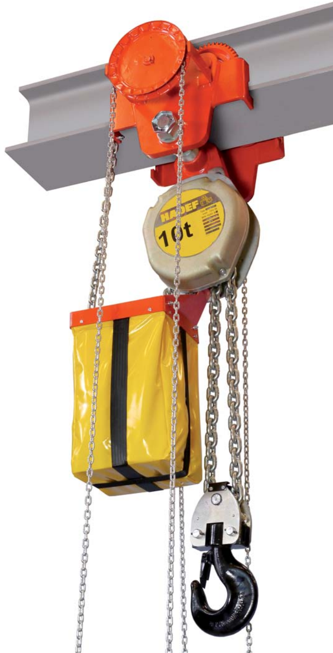
Chain container as option